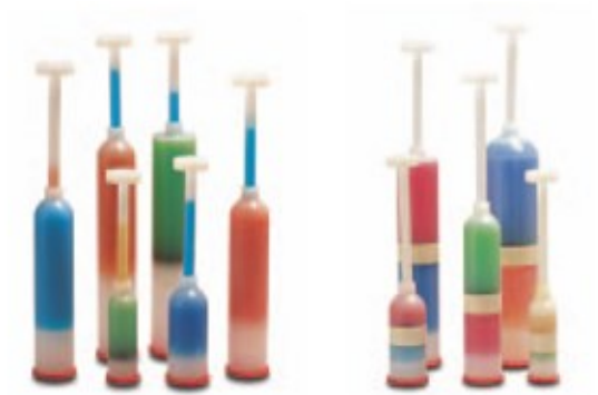
Injection style Semkit® packages for multi-component adhesives and sealants