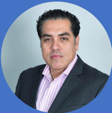
Conrado Ayala Cordoba Corporation