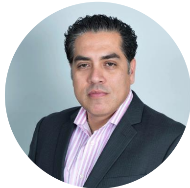
Conrado Ayala Cordoba Corporation