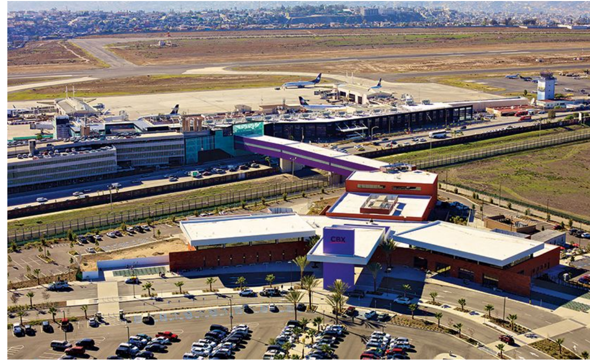
Cross Border Xpress (CBX) connecting passengers from the US to Tijuana's International Airport.

SOURCE OF DATA: US DOT Statistics, Cross border travel behavior survey, SANDAG (2020).